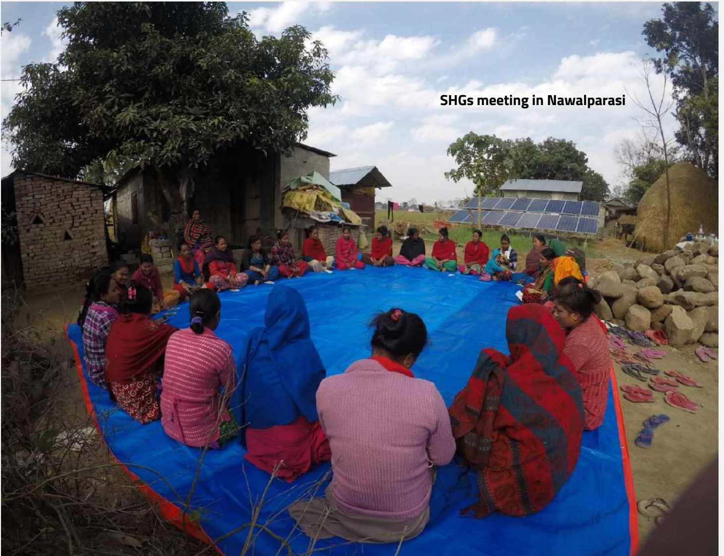
SHGs meeting in Nawalparasi

Asal Chhimekee Nepal P.O. Box 263 Simpani -1 Pokhara +977 61 525516, 534159 info@acn.org.np