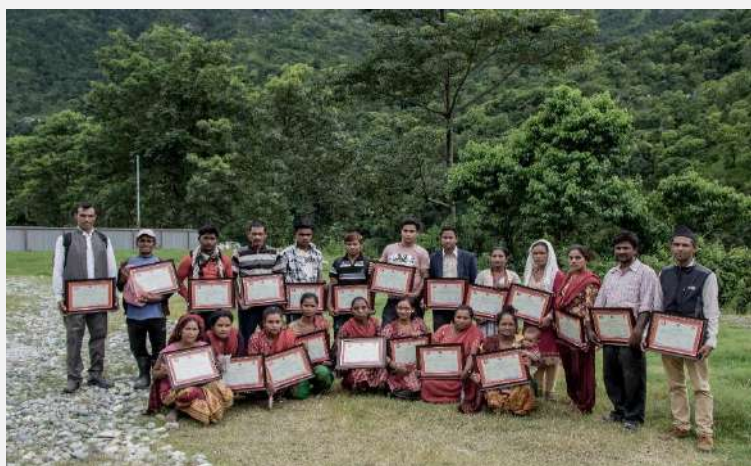
Beneficiaries group photo after Handover program

In order to support the affected families, ACN initiated a project called 'Private House Reconstruction Support programme-Parbat' to provide construction materials and technical support in coordination with Jaljala rural municipality and affected families. On 30th July 2019, ACN handed over 22 reconstructed houses in the presence of the Minister of Physical Infrastructure Development, Gandaki Province and other government representatives and community people.