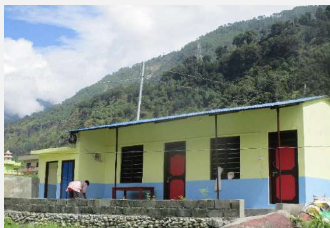
Reconstructed house after color painting