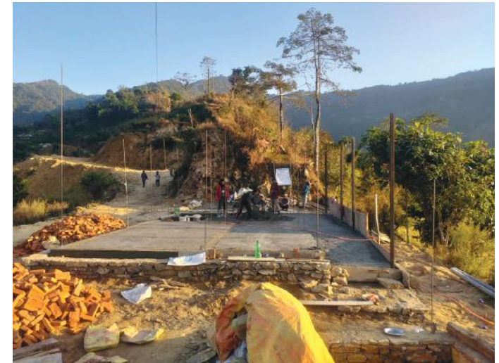
Latest picture of under construciton project in Gorkha

We would like to thank for your continuous generous support and also, request to support us so that we can complete this construction. So that villagers feel comfortable and safe taking service from own rural clinic building.