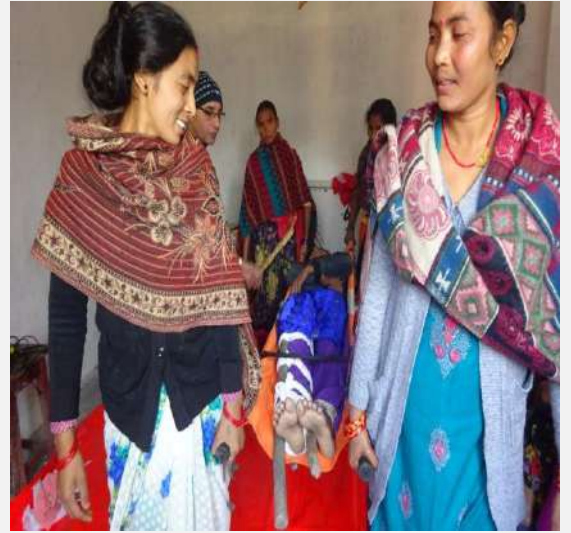
Participants learned to carry injured with the help of stretcher

The training focused on disaster and emergency situation, vulnerability, steps of disaster management, first aid education on electric shock, burn, accidents and snake bites, and how to identify injured. In addition, the facilitator also provided practical knowledge on making stretchers with local materials and ways of properly carrying injured. The trainer facilitated the training in their local language so the training went well.