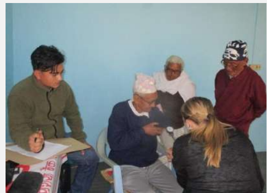
During measuring blood pressure in elderly care home.

Similarly, ACN also conducted a health teaching program on personal hygiene and care to elderly people at Ramghat Church, Pokhara.