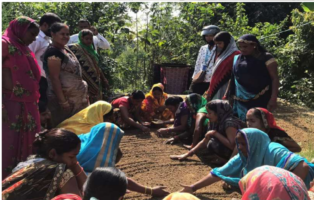
46 community members participated in 2 small business training events conducted for SHGs of Palhinandan Rural Municipality, Nawalparasi.