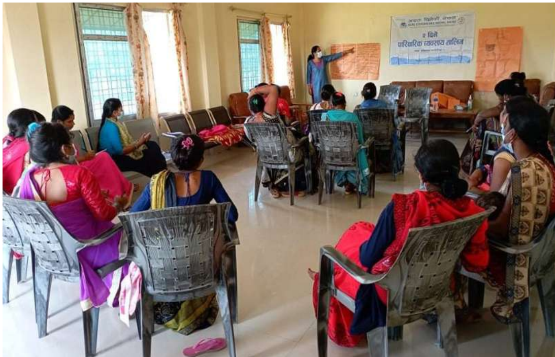
47 people participated in 2 basic agriculture training events conducted for SHGs of Palhinandan Rural Municipality, Nawalparasi.